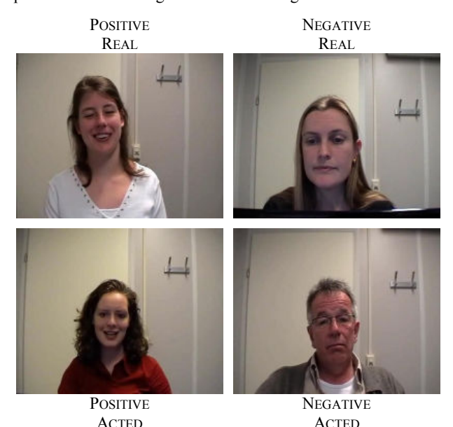
Figure 1: Representative stills of acted (top) and real emotional (bottom) expressions, with on the left hand side the positive and on the right hand side the negative versions.

for the induction of real emotions (POSITIVE, NEUTRAL, NEGATIVE), two acting conditions were added. In one of these, participants were shown negative sentences and were asked to utter these as if they were in a positive emotion (ACT POSITIVE); in the other, positive sentences were shown and participants were instructed to utter these in a negative way (ACT NEGATIVE). The sentences showed a progression, from neutral ("Today is neither better nor worse than any other day") to increasingly more emotional sentences ("God I feel great!" and "I want to go to sleep and never wake up." for the positive and negative sets, respectively), to allow for a gradual build-up of the intended emotional state.